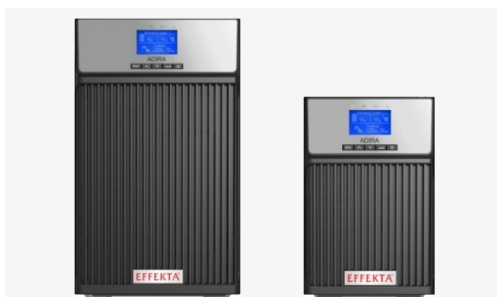
Left ADIRA T 2-3 kVA Right ADIRA T 0.7-1.5 kVA