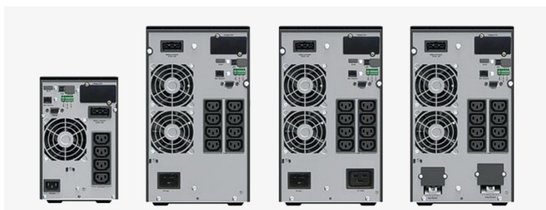
Back sides from left to right: 0.7-1.5 kVA (incl. XL) / 2 kVA (incl. XL) / 3 kVA / 3 kVA XL